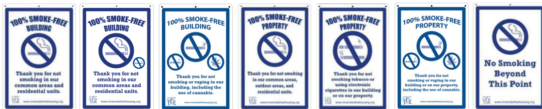
Outdoor Signs Metal - 12" X 18"