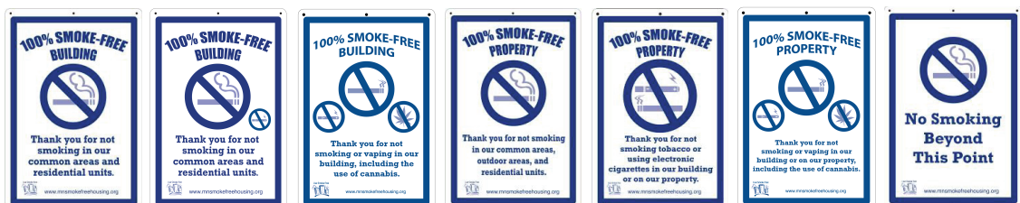
Outdoor Signs Metal - 12" X 18"